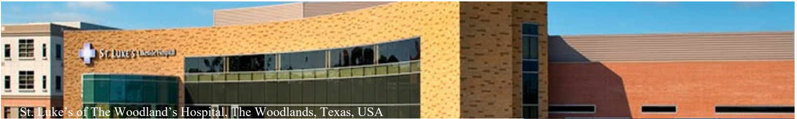
St. Luke's of The Woodland's Hospital, The Woodlands, Texas, USA